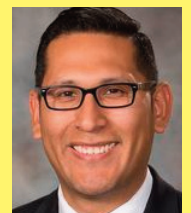
Sen. Tony Vargas State Senator in the Nebraska Legislature; Candidate for U.S. Congress