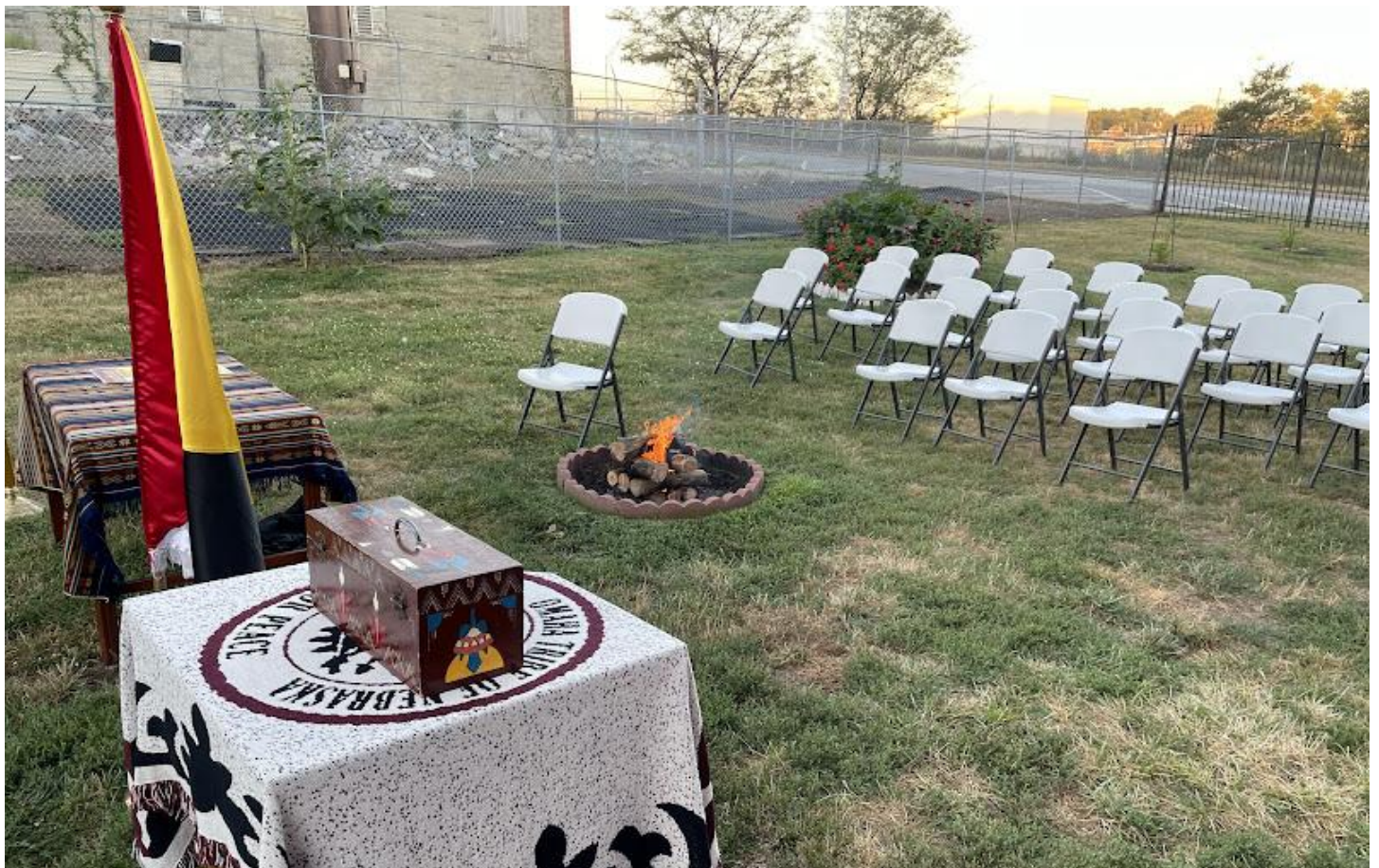
PHOTO: The Maya Community Sacred Site serves as the location for the Opening Ceremonies of the 2022 Indigenous Peoples Summit