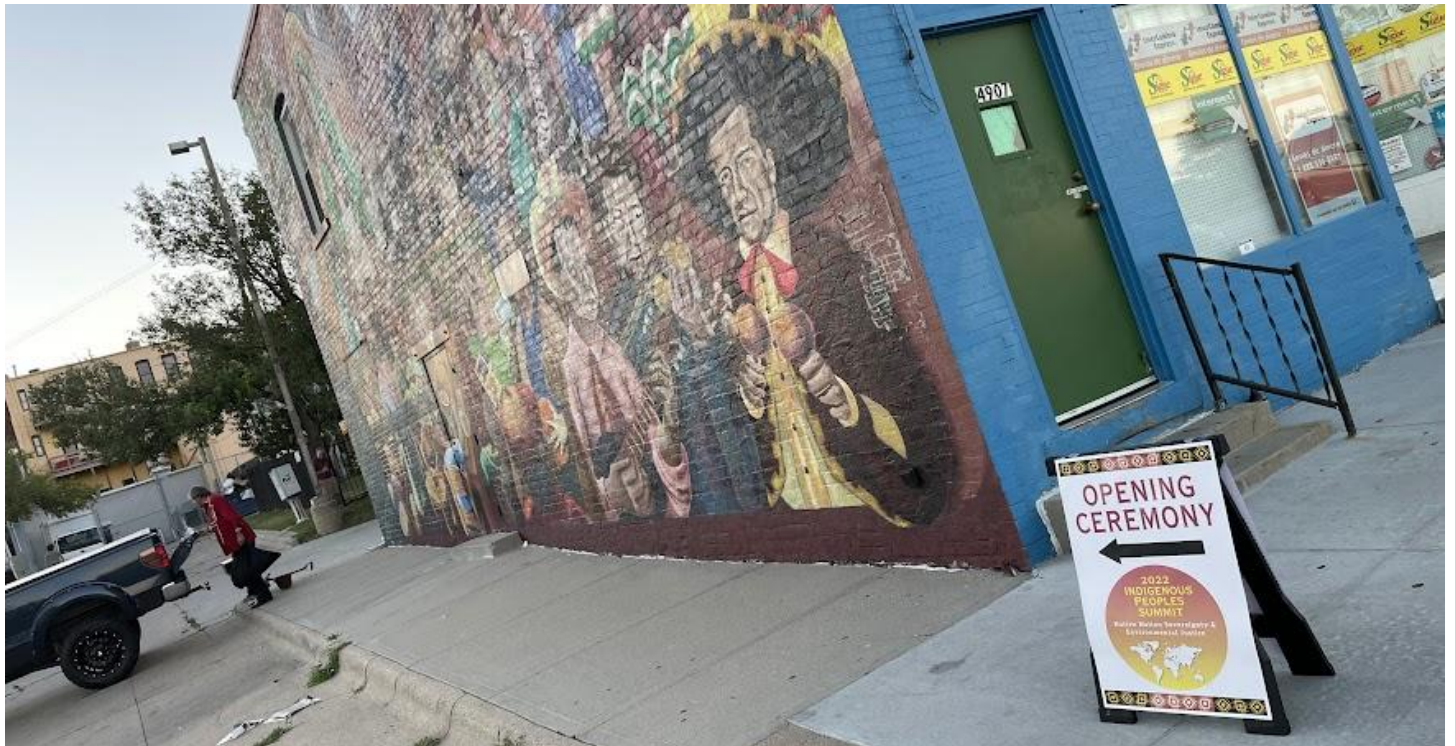
PHOTO: A sign points to the Opening Ceremonies of the 2022 Indigenous Peoples Summit, which included a Commemoration Ceremony, a Cedar Ceremony and a Breaking the Mourning Ceremony